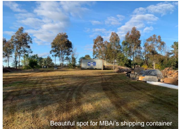
Beautiful spot for MBAi's shipping container