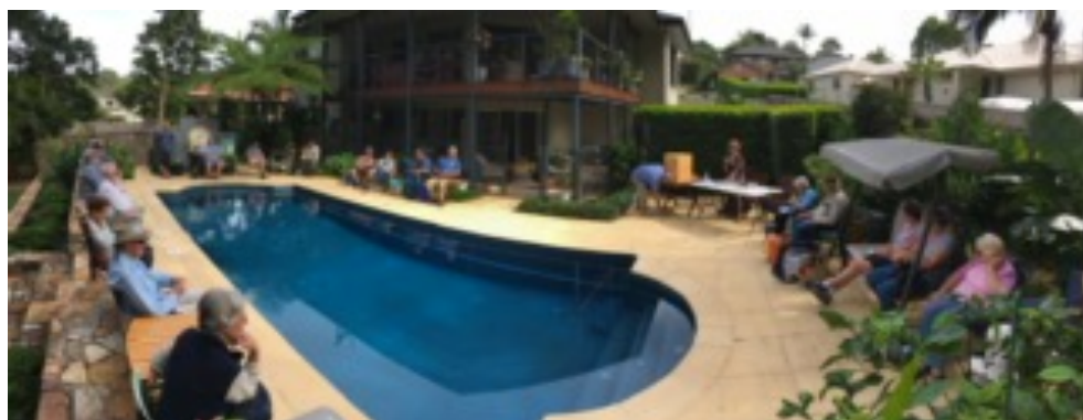
Top left & bottom right: A good turn out in a beautiful setting.