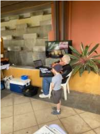
At left: The young and the not so young - talking bees of course.