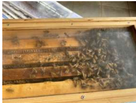
At left: Our bees in their Temporary home for the 2 days

Our bees were very popular with all and made it safely home to Castle Hill.