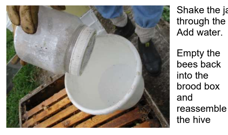
Check the bucket. Any varroa or tropilaelaps will float on the water surface. Varroa look like small brown carroway seeds.

Roll the jar for several minutes do the bees are well coated with sugar mix.