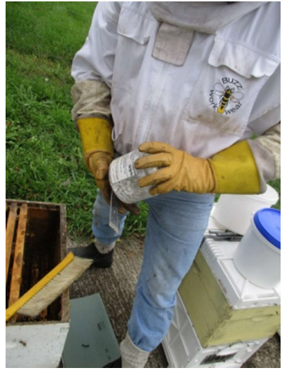
Shake a frame of bees onto the folded paper and transfer them to the sugar shake jar. Screw on the mesh lid.

Roll the jar for several minutes do the bees are well coated with sugar mix.