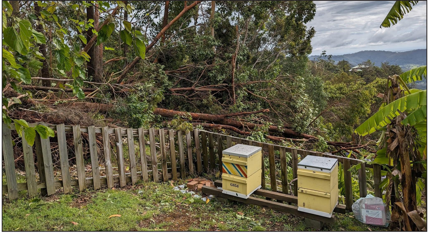
GCABS member Trav Green's apiary on Tamborine Mountain narrowly escaped damage in the 25/12/2023 fierce storms with 200kph + winds. IF YOU HAVE LOST HIVES in the storm please let GCABS support you. Contact committee.