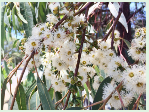
Small fruited grey gum

Brush Box. Coolibah. Flat Weed. Grass Tree. Lucerne. Maize. Mexican Poppy. Moreton Bay Ash. Poplar Box. Red Stringybark. River Red Gum. Rough-barked Apple. Rusty Gum. Silver-leaved Ironbark. Smudgee. Swamp Mahogany. Western Teatree, Hickory Wattle. Pink Bloodwood. Small-fruited Grey Gum.