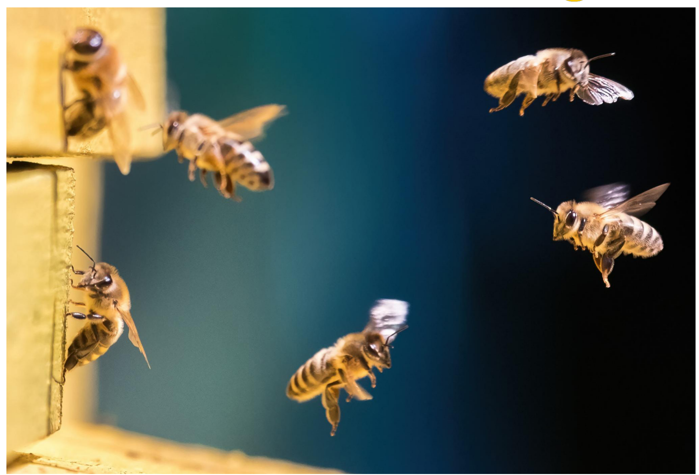
Some leave, others arrive but most will stay the same. Same for GCABS committee this month!